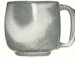
*4M—18 OZ. MUG—3.00