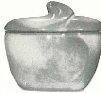
4B—SUGAR WITH LID—3.00