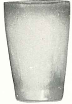
*5L—12 OZ. TUMBLER—2.00