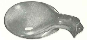
*4Y—6" SPOON HOLDER—2.00