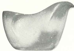
4A—8 OZ. CREAMER—2.00