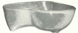
*4N—24 OZ. VEGETABLE—2.50