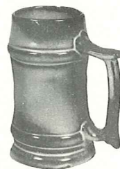
*M2—18 OZ. STEIN—3.00