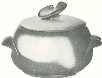
*4V—2 QT. BAKER/BEAN POT—6.00