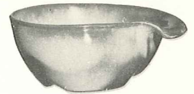
*4X—14 OZ. CEREAL—2.00