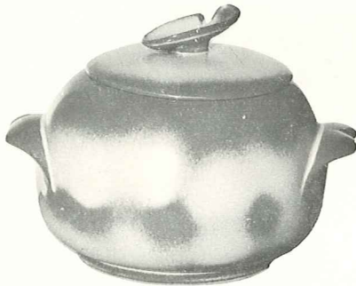
*4W—3 QT. BAKER/BEAN POT—7.50