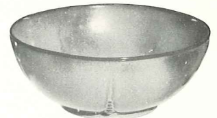
*224—8" ROUND BOWL—3.50