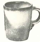
*5CC—5 OZ. TEACUP—2.00