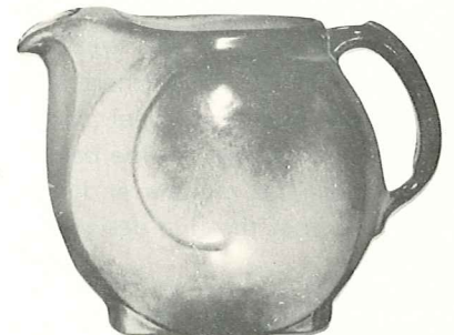
*4D—2 QT. PITCHER—6.00